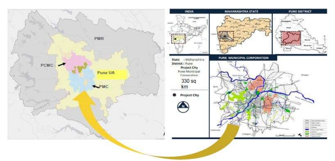
Figure 2 - Location of the study area

The first case of COVID-19 was detected in Pune on 9th March 2020. The city created a COVID-19 response team and a 106-bed isolation facility. Meetings were held with department heads, government hospitals and public representatives to devise a preparedness plan.